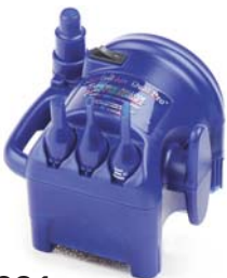
831 Mini Cool Aire® Dual Pro™ Inflator