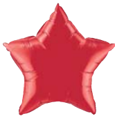
4- ea 13ST-04 Ruby Red 4" Qualatex® Star