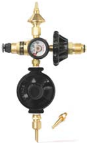
BR74HG Dual Foil + Latex Regulator