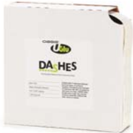
01541 12- ea OASIS®. Glu™ Glue Tape Dashes