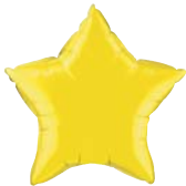
4- ea 79ST-04 Citrine Yellow 4" Qualatex® Star