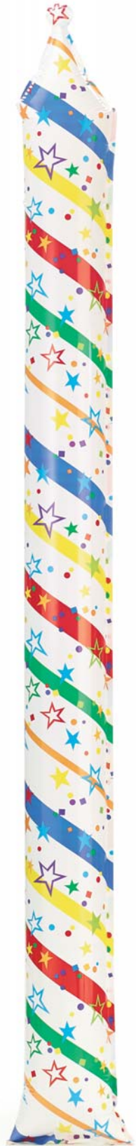
1-ea 0738-36 White 71" Rocket Balloon