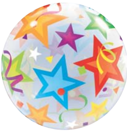
1- ea 2539-26 22" Bubbles™ balloon