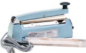
HS870 Maxi Seal® Heat Sealer