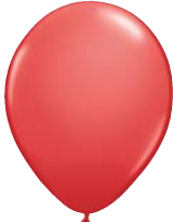
8- ea Q-11-23 11" Red Qualatex®